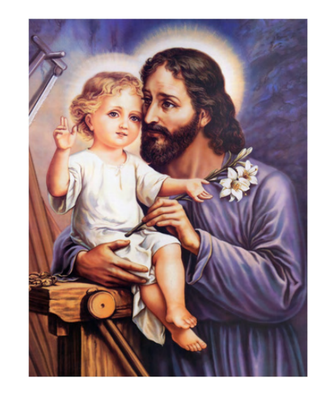
St. Joseph: Our Spiritual Father